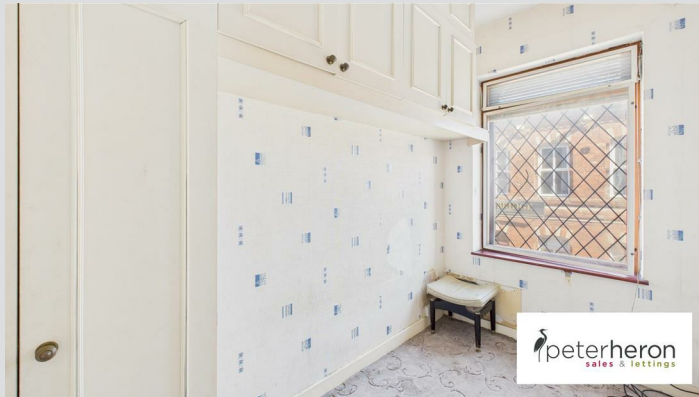
Double glazed window to front with secondary glazing, radiator and built in wardrobes.