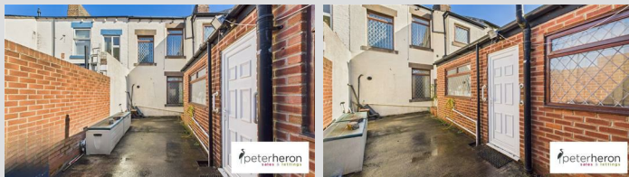
Enclosed courtyard to the rear. with roller shutter access door.